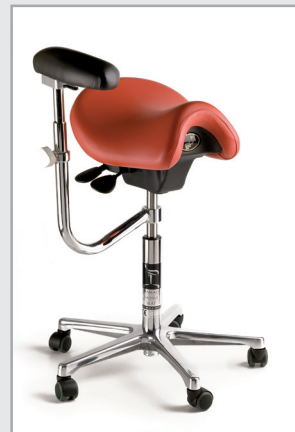
Fig. 4: The Bambach Saddle Seat (Hager & Werken) is available in different colors and versions. Therefore it fits into every treatment room.

Mary Gale, an Australian occupational therapist and inventor of the Bambach Saddle Seat, researched the sitting position on horses, the fact that people with a wheelchair are able to sit on horseback without any support and why equestrians suffering from back problems are pain free once on horseback. You can learn more about her experiences from her book and leaflet about this seat. Please request free literature and appointment for demonstration at Hager & Werken's ( www.hagerwerken.de ). Legions of dental professionals and the general public cannot move without pain due to poor posture. Choosing the Bambach Saddle Seat will solve this problem. Make the smart choice. On a Bambach Saddle Seat.