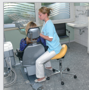
Fig. 1: The perfect posture with the Bambach Saddle Seat.

The Bambach Saddle Seat comes in various designs. With backrest or with additional armrest, or – which is my favorite – Classic, without any extras. “Cutaway”, the seat with narrow curvature, is suited for small and slender persons, like our female staff. I also like the special seat for surgery as its height can be adjusted by foot. And not to be forgotten – The Bambach before seating can be adjusted in its inclination as well. Persons of different body heights profit from the selection of various column heights. The seat is covered in breathable leather and Hager & Werken has just recently changed for the better, now using high noble leather from German car manufacturers. Your pants will never be soaked with sweat even in case of longer treatments. Additionally, the seat is available in any color matching your treatment unit. I also tested Bambach in longer