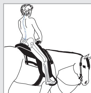
Fig. 3: The Bambach Saddle Seat is inspired by the straight posture of horseback riders.